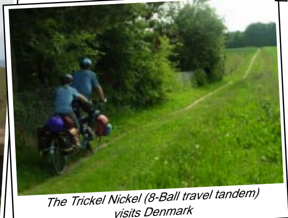
The Trickle Nickel (8-Ball travel tandem) visits Denmark