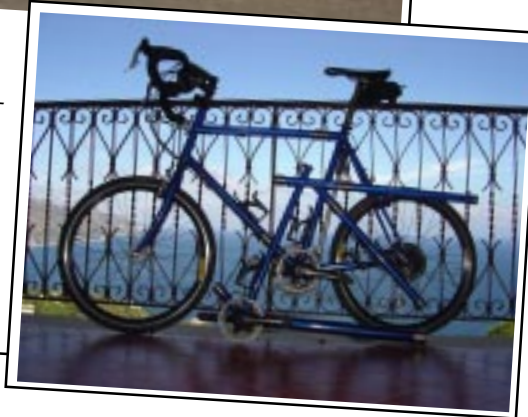
Right: The Gohman's tandem in its single status. Read more in our online scrapbook at www.rodcycle.com